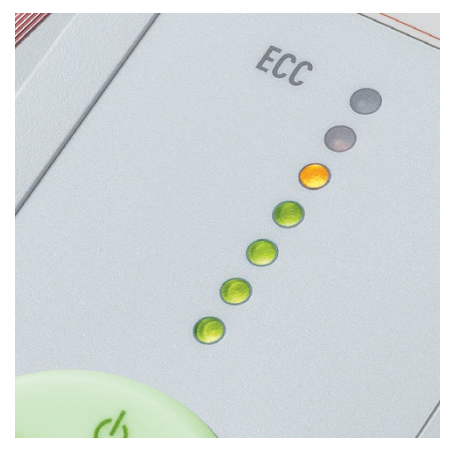
ECC - ELECTRONIC CAPACITY CONTROL This electronic feature indicates the used sheet capacity during shredding process to avoid paper jams.

Ease of operation: intelligent multifunction switch element with integrated optical signals indicating the operational status. Additional "emergency switch" function.