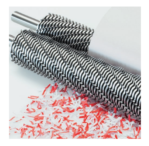
SOLID STEEL CUTTING SHAFTS

Robust and durable: high-quality paper clip proof cutting shafts with lifetime guarantee under conditions of fair wear and tear.